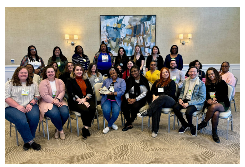
2024 DVAA Graduates

Monday through Thursday 8AM-5PM; Friday 8AM-3PM